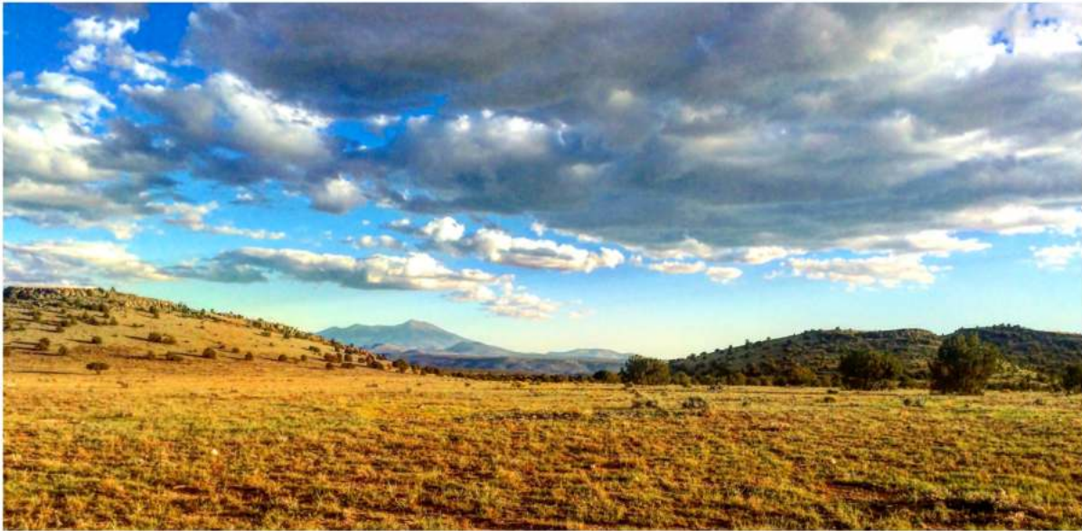
Top Left: Women's 2018 100-Mile Winner and course record holder Colleen Lingley Top Right: Men's 2018 100-Mile Winner and course record holder Michael Bursum Bottom: Mile 42, looking south from Babbitt Ranches to The Peaks